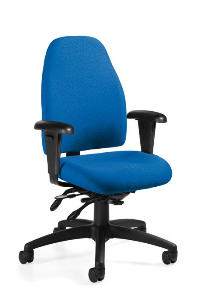
4432 Low Back Multi-tilter with optional OJ kidney shaped ergo-gel arm